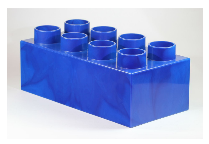
Fig. 2: The stacking blocks presented at WITTMANN booth are made of 100 % recycled polypropylene, which was processed using the Cellmould foam injection molding technology.